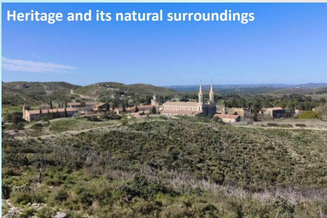
Heritage and its natural surroundings