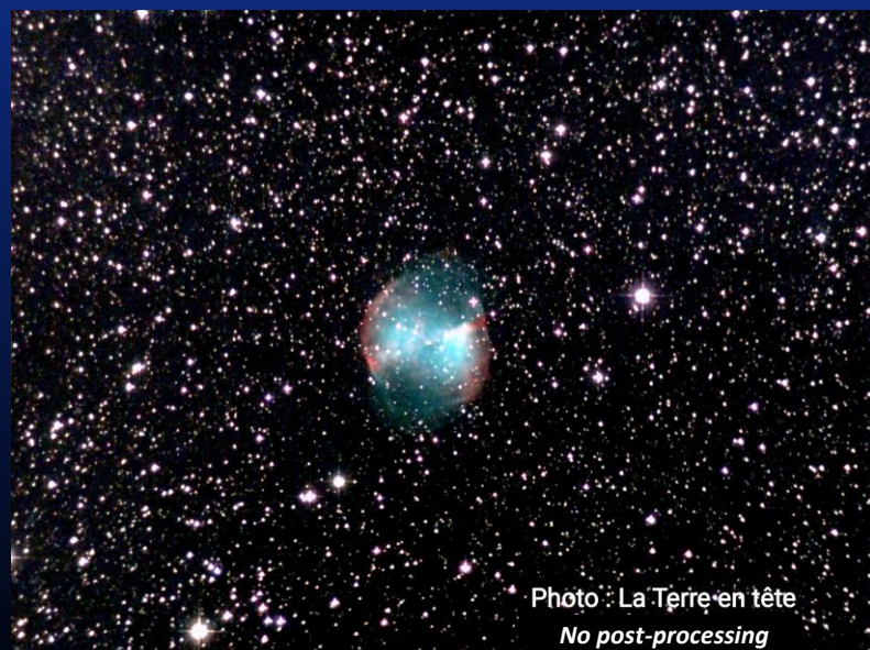
No post-processing