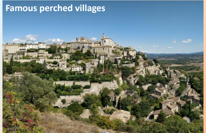
Famous perched villages